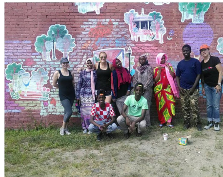
LHS 21st Century Leaders showcase their work from our Summer 2017 internship program. "Leading through Art" students unveil their community unity mural on the side of the Poise Yoga Studio building. Additional programming includes a poetry reading, and film screening at Lewiston Public Library.