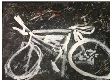
Paintings by Douglas Haig will be on view at Forage Public Market. Pictured is Bicycle, 38x48 inches wide, acrylic on canvas.