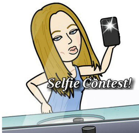
Second annual Downtown Lewiston Arts District selfie contest!

Visit Poise Yoga & Foot Sanctuary, Wicked Illustrations, and The Studio, enjoy the art and snacks, take a selfie inside the business, post it to their Facebook page and you will be entered to win a painting from Wicked and a yoga mat, flax and lavender eye pillow and a yoga class from Poise!